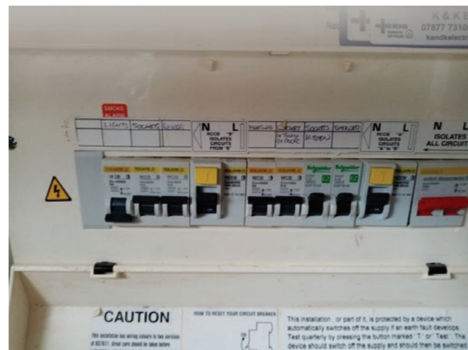
Fuse Board Tripped - this shows lights have tripped the fuse board.