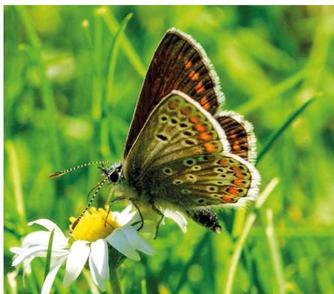
Female common blue butterfly