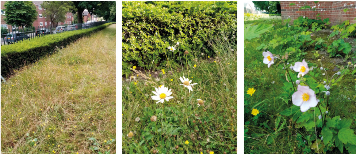
Leander Courts' rewilding area