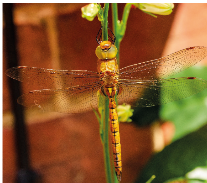
Norfolk Hawker Dragonfly