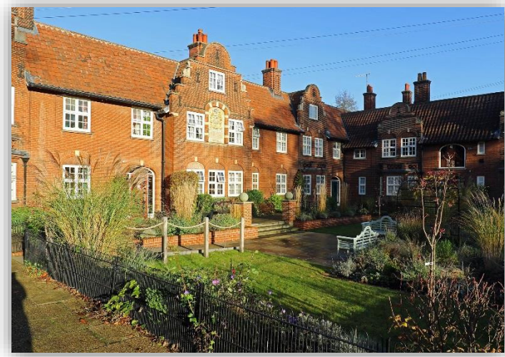
Stuart Court, Recorder Road